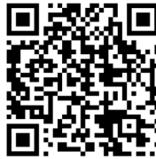
Sponsor a Zambian Child