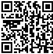
Purchase Catalog Gifts